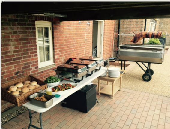
Table linen is not included in this package but can be obtained on your behalf, let us know your requirements and we will provide you with a quote.

Should you want the Hog Roast Package as a sit-down service with a sharing style theme please add £5 per person , this includes all staffing, cutlery, crockery, table glassware, set up, clear down & food rubbish removal.